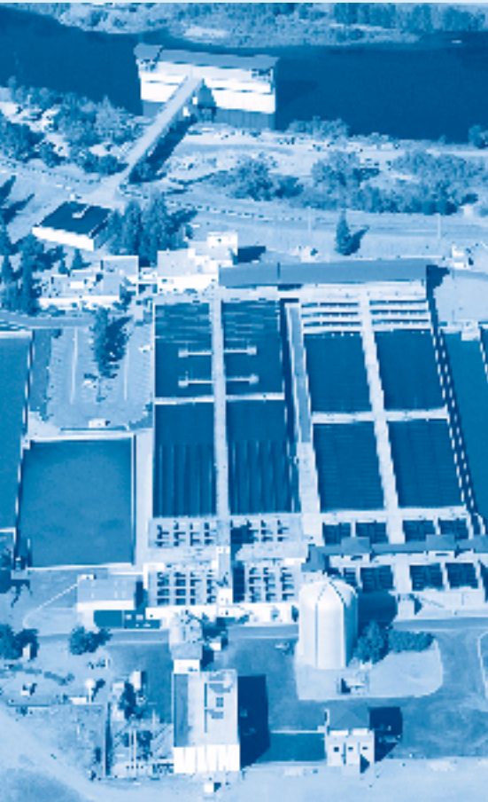
Fairbairn Water Treatment Plant